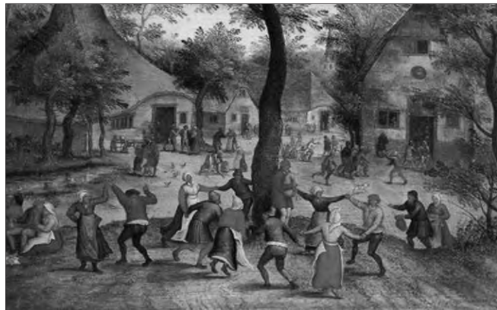
A village celebrating May Day.

During the early 1770s, St. Tammany became the symbol of many of the regional groups protesting English taxation, including the Sons of Liberty in