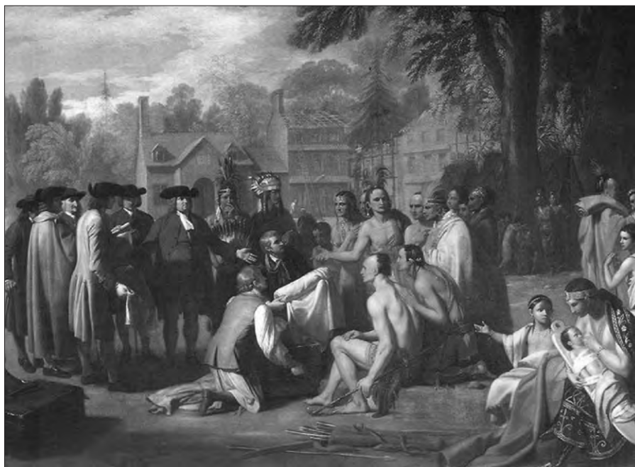
William Penn and Tammany meet to sign their peace treaty.

May Day celebrations have their roots in pre-historic Europe as pagan celebrations of the beginning of the growing season. In England, the Druids celebrated the festival of Beltane, which marked the beginning of the agricultural half of the year.