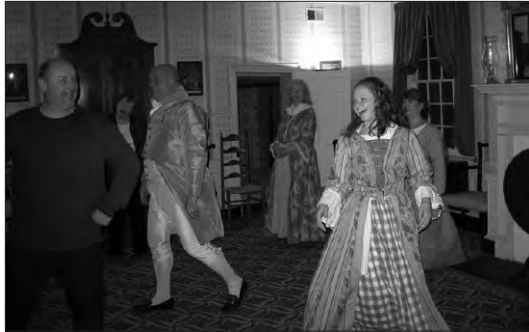
Party goes dancing in the parlour.