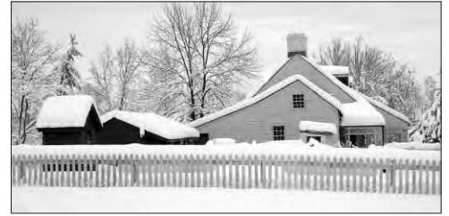
Woodville, after the February snow storm.